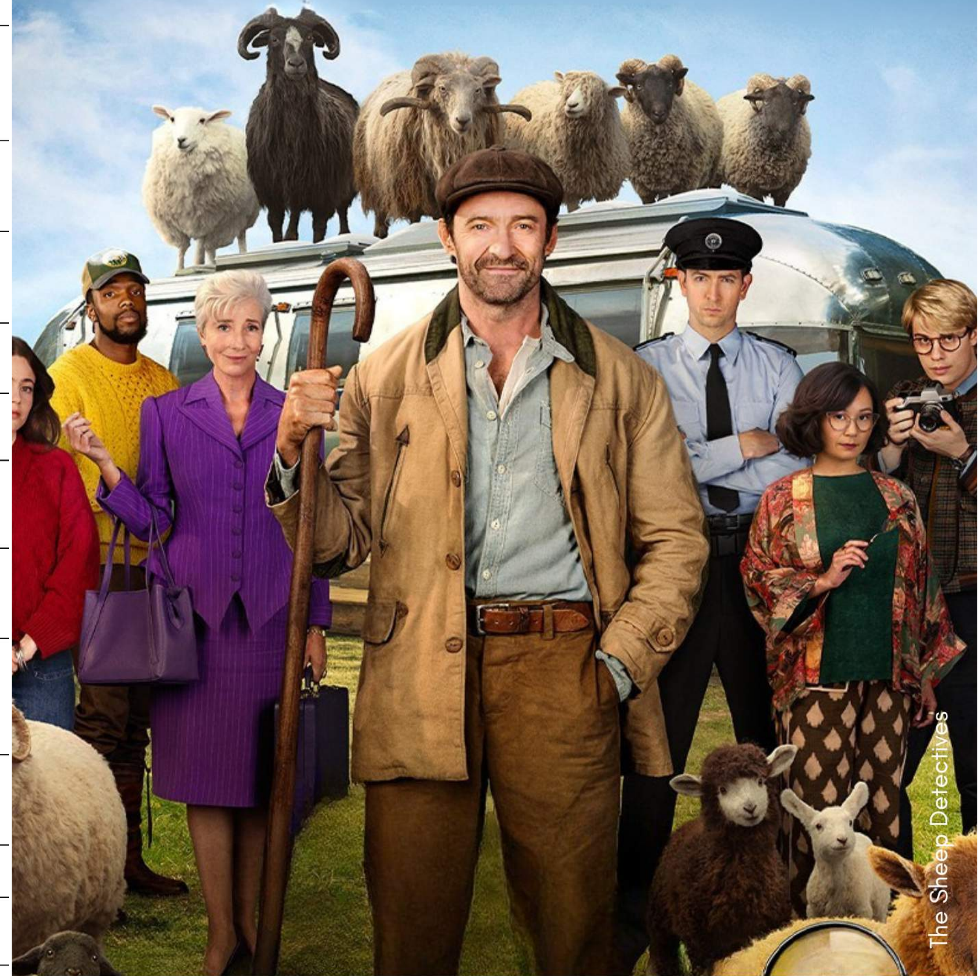
The Sheep Detectives

Please visit our website HBPH.CO.UK for trailers, ticket information and bookings. Become a member to get £2 off every film, £4 off Live Arts tickets, plus exclusive members-only perks!